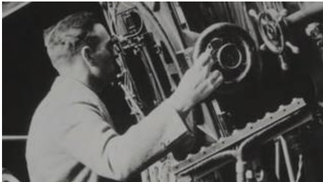
The Hubble Space Telescope is named in honor of astronomer Edwin Hubble.

Generally speaking, Earth's atmosphere changes and blocks some of the light that comes from space. Before the Spitzer Space Telescope program came into effect, the Hubble telescope was launched. Hubble orbits high above Earth and its atmosphere. Hubble can see space better than telescopes here on Earth for Hubble uses radio waves to send the pictures through the air back to Earth.