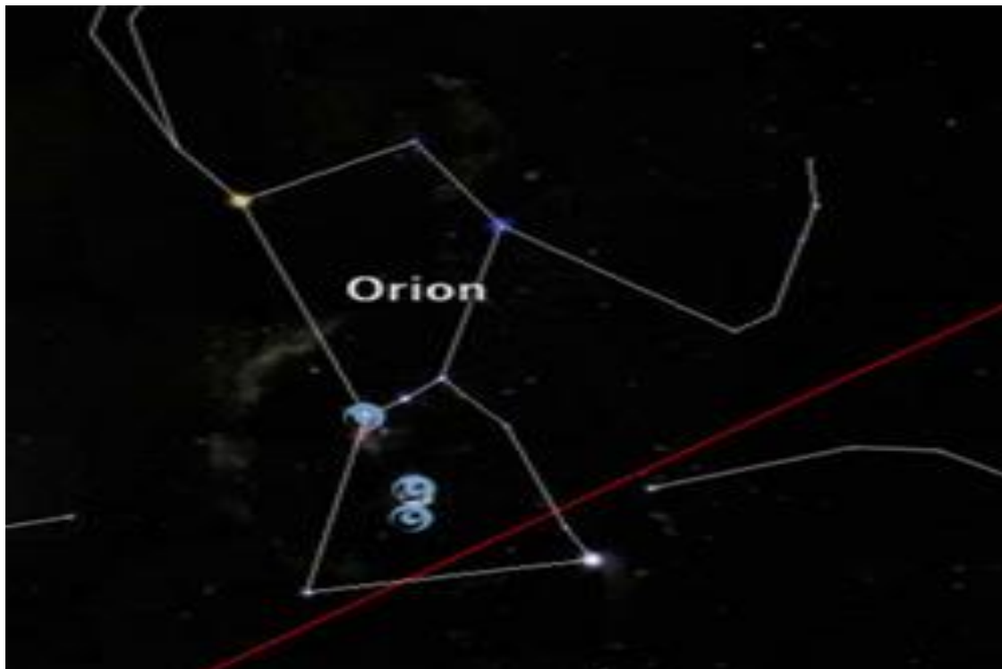
Hubble Teams With Google to Bring the Cosmos Down to Earth.