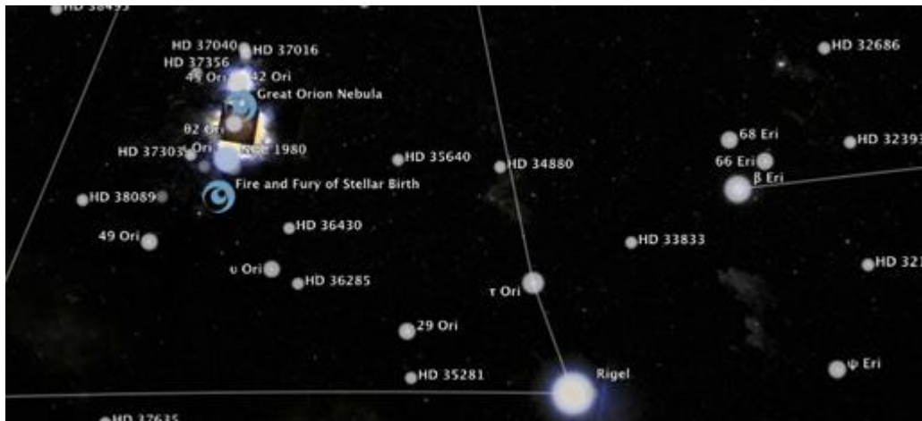
Image above: Screen capture of the Orion constellation border and numerous astronomical objects located in the direction of that constellation.